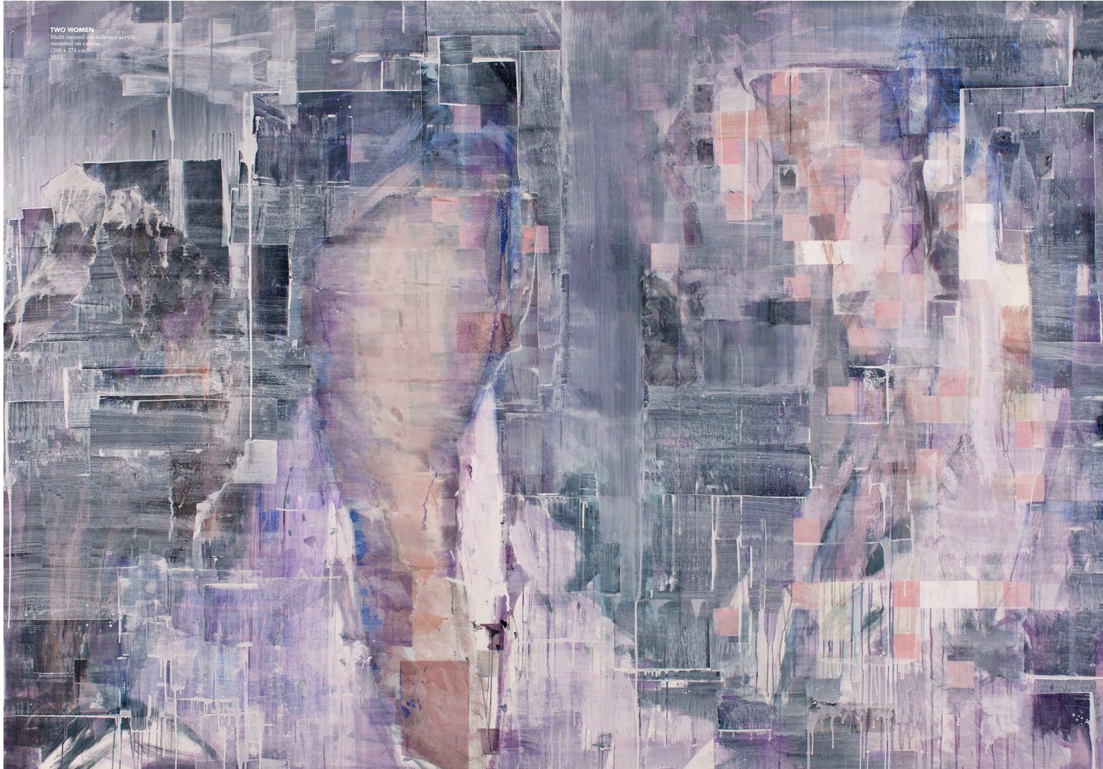
TWO WOMEN Multi-layered oil, tile and acrylic mounted on canvas (200 x 274 cm) 2013