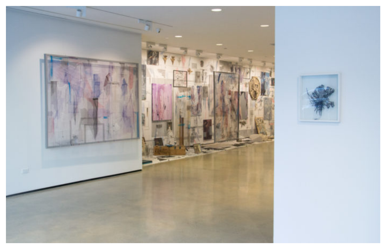
ACAW's Thinking Projects Pop Up at C24 Gallery, installation view.

https://artefuse.com/2017/10/23/re-thinking-home-acaws-thinking-projects-pop-up-at-c24-gallery-125221/